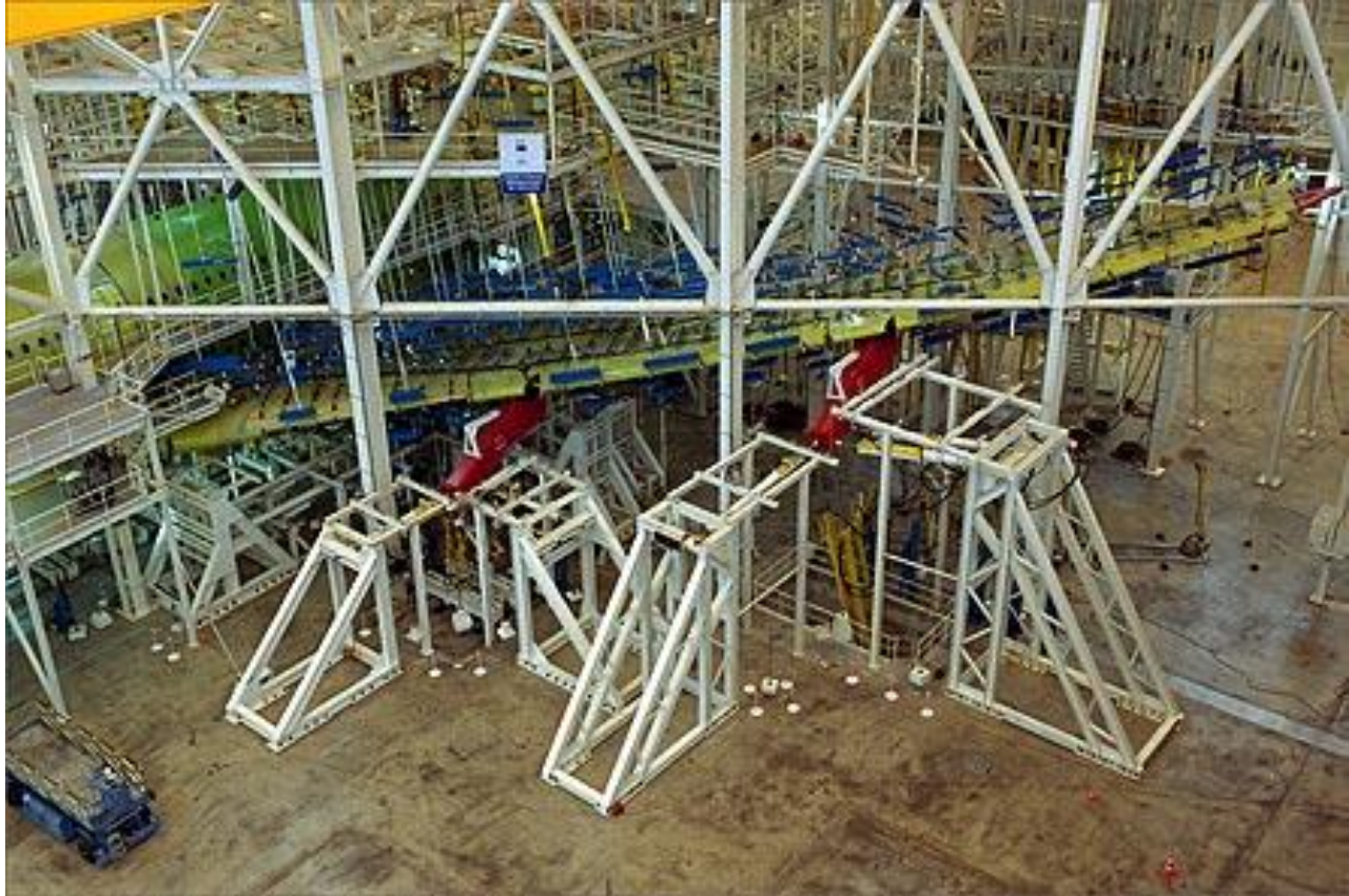
Airbus A380 wingload tests up