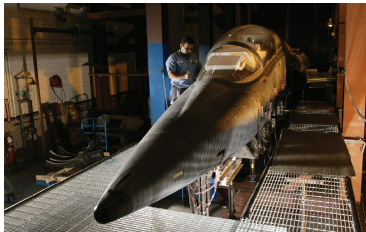
Full-scale fuselage testing

Custom test rigs designed, fabricated and used by SwRI for structural testing