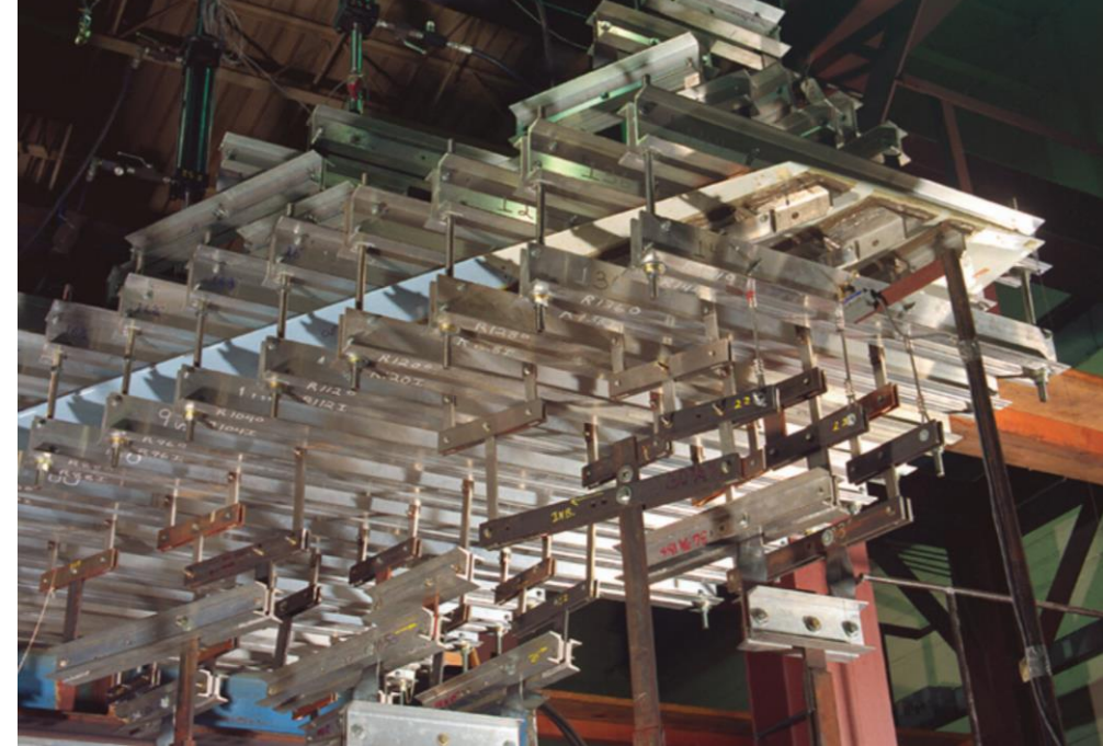
Example of a distributed wing load test